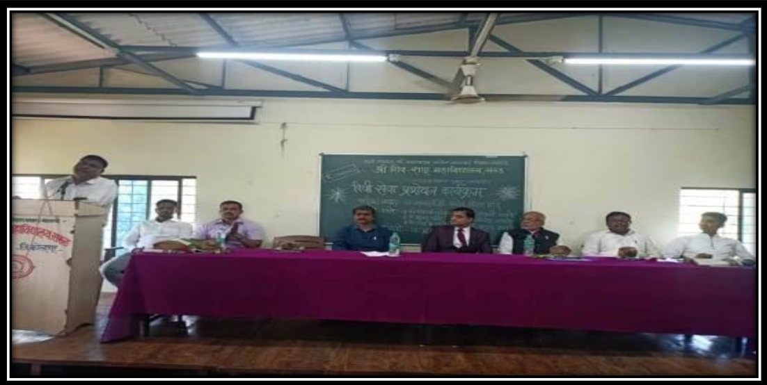
Hon. Parag Kanade delivering lecture on "Women Empowerment Laws"